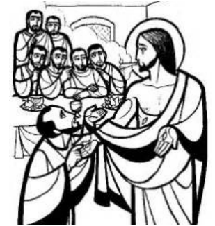
Eight days later, Jesus Came