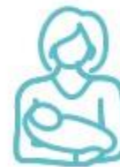
Pregnancy and Maternity