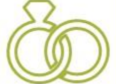
Marriage and Civil Partnership