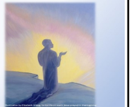
An exploration of prayer