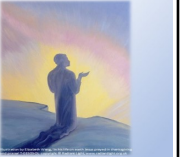
An exploration of prayer