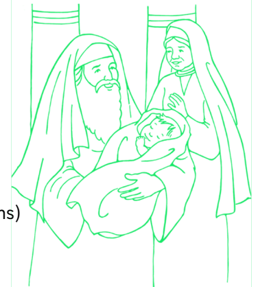
Simeon & Anna thank God